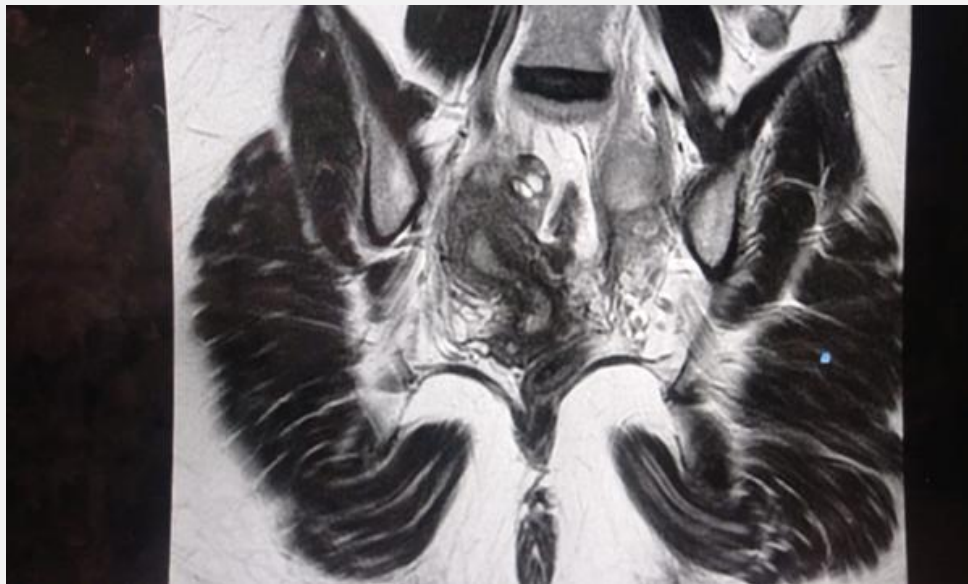
Figure 2: Coronal image of MRI pelvis showing right-sided uterine horn