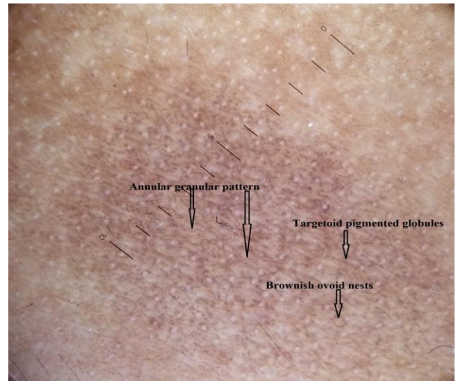
Figure 3: Dermoscopic picture of LPP lesion