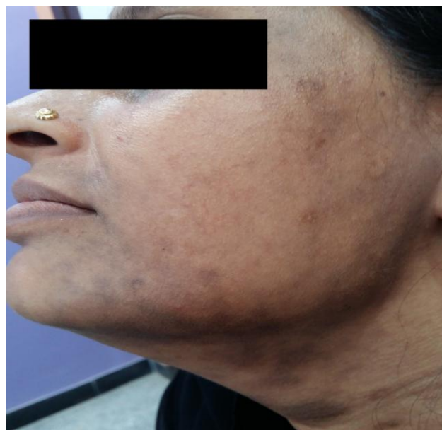
Figure 1: Clinical image of LPP lesions

Lichen planus pigmentosus (LPP) is an atypical pigmented variety of lichen planus. [1] It is diagnosed by the presence of irregularly-shaped brownish black to gray patches. The forehead, temples, neck and upper chest are most commonly affected as LPP has propensity for photo exposed areas. [2,3] Furthermore, the patches of LPP can also involve trunk or flexures (i.e. the axilla, groin, etc). [1-3] Lichen planus pigmentosus is an unpredictable relapsing dermatosis with periods of activation and remission with poor therapeutic response and may leads to cosmetically disfiguring post inflammatory pigmentation. The aetiopathogenesis of LPP is still a mystery, but previous publications have revealed that it may be triggered by light, viral infections, or cosmetic photo sensitizers applied to the skin. [1-4] Treatment for LPP is very cumbersome and it is tailored according to the patient. [3]