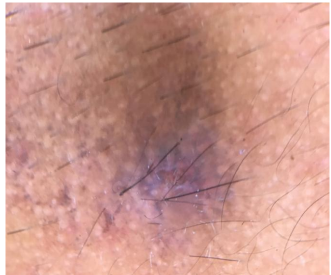
Figure 4: Rare occurrence of Wickham's striae with other dermoscopic findings in a case of LPP