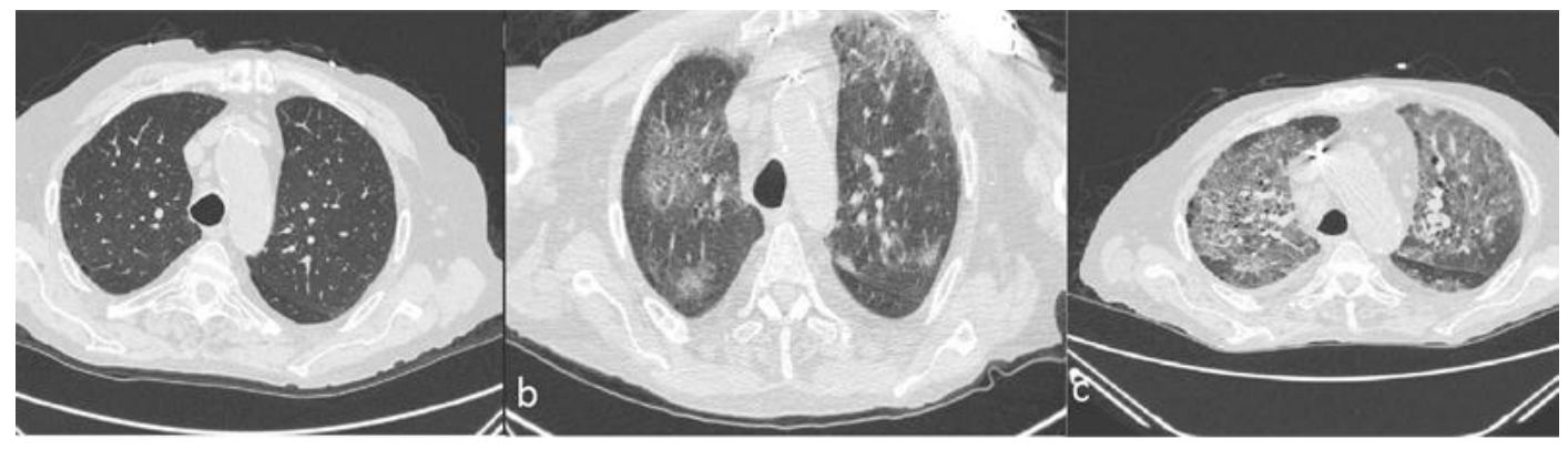
Fig.1: Computerized Chest Tomography scans of the first patient: a) first chest HRCT executed on March, 30; b) chest CT of April, 14; c) second chest HRCT executed on May, 1