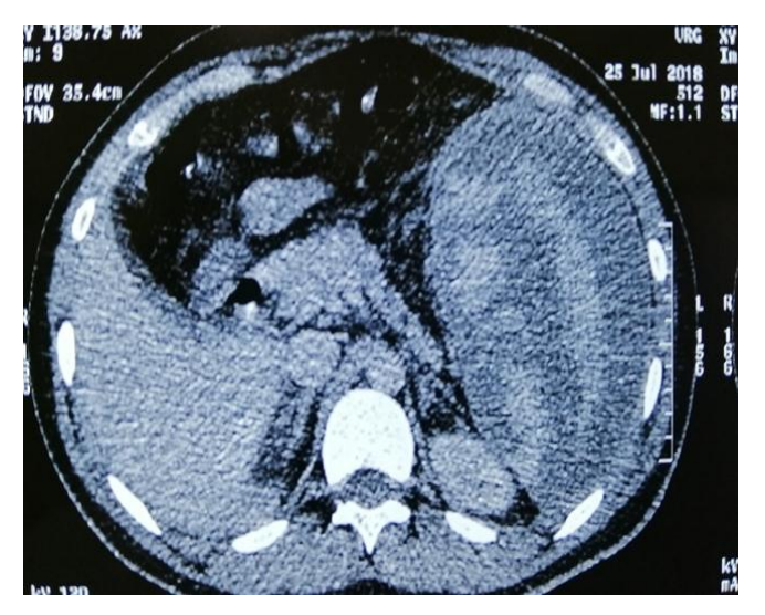
Figure no 1: CT image

A abdominal CT scan was done and revealed a ruptured spleen with mild (Figure 1).