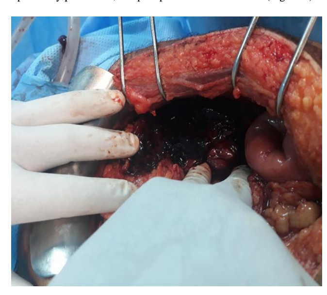
Figure no 2: intraoperative image of the splenic compartment.

Due to serious condition of the patient, an emergency median laparotomy performed, left peri-phrenic clots removed (Figure 2).