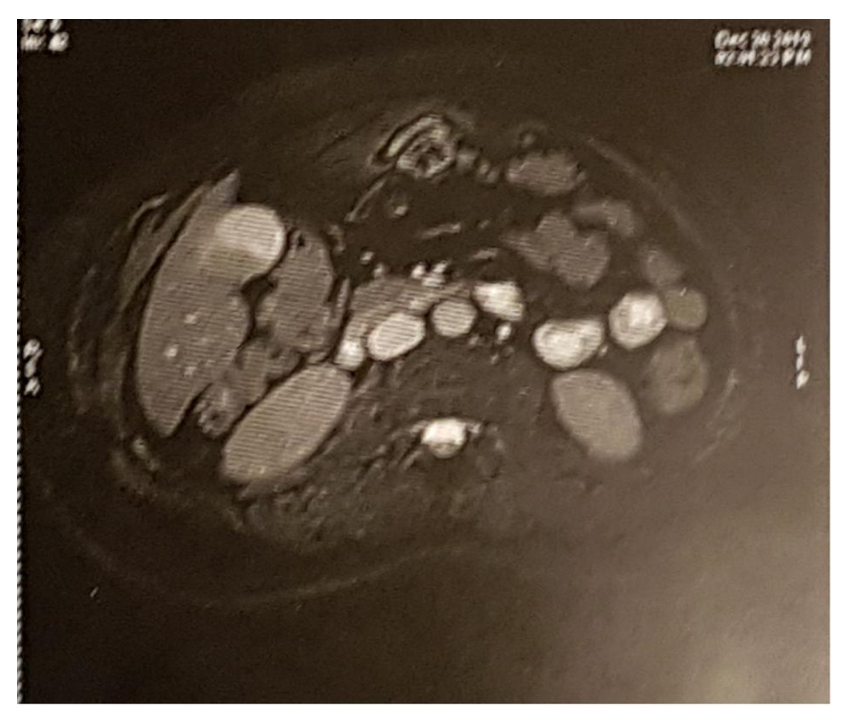
Figure 2: Computed tomography images show a 1.6 \times 3.2 cm mass located on the body of gallbladder

The CT scan and MRI showed an intra-luminal process of the gallbladder and multiple hepatoduodenal nodes; with no evidence of hepatic invasion (Figure 2 and 3).