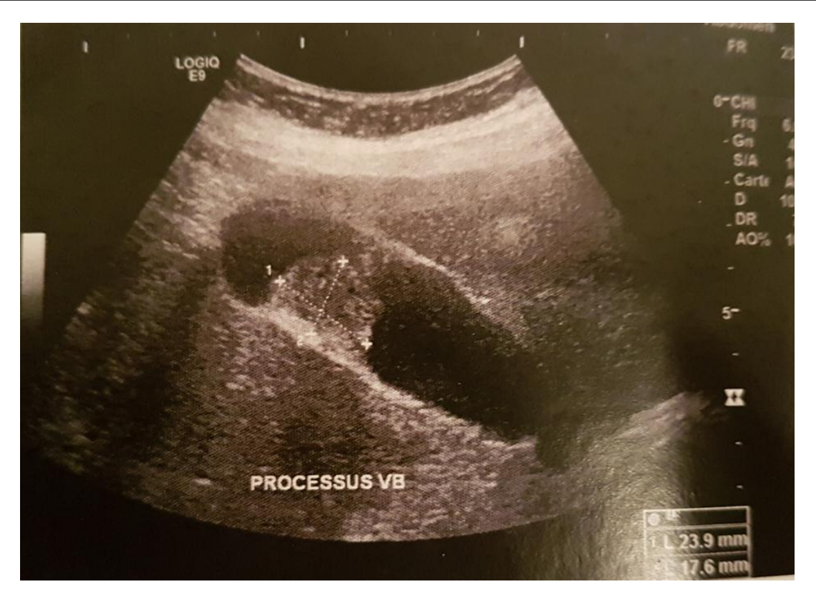
Figure 1: Ultrasound image showing the gallbladder tumor. The gallbladder is stone free.

Laboratory findings including tests for tumor markers were normal.