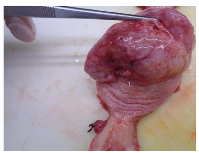
Figure 3: Histerectomy piece- macroscopical appearance

histopathological exam, the patient was cured with a total hysterectomy with bilateral adnexectomy (Figures 3 and 4).