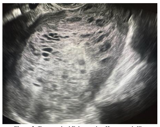
Figure 2: Transvaginal Echography- Honeycomb-like appearance

Figures 1 and 2-No normal uterine cavity line was noted. The cluster that was approximately 89 \text{ mm} \times 75 \text{ mm} \times 87 \text{ mm} in size. Several different dark liquid areas, as part of the honeycomb-like appearance