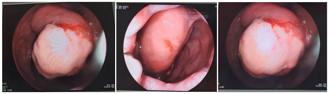
Figures 1,2,3: Showing an intra-rectal mass