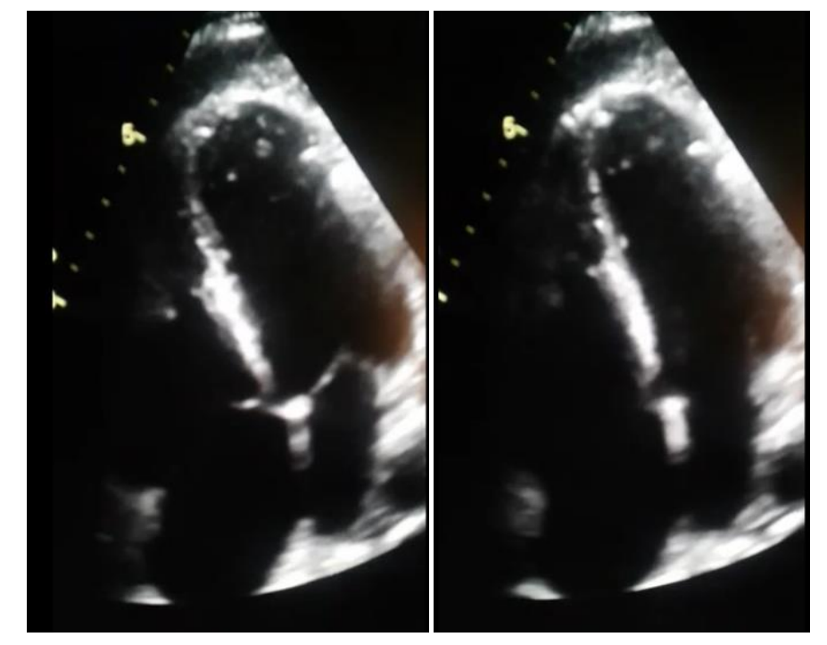
Figure 3: Trans-thoracis echocardiography with a left ventricular ejection fraction of about 35%