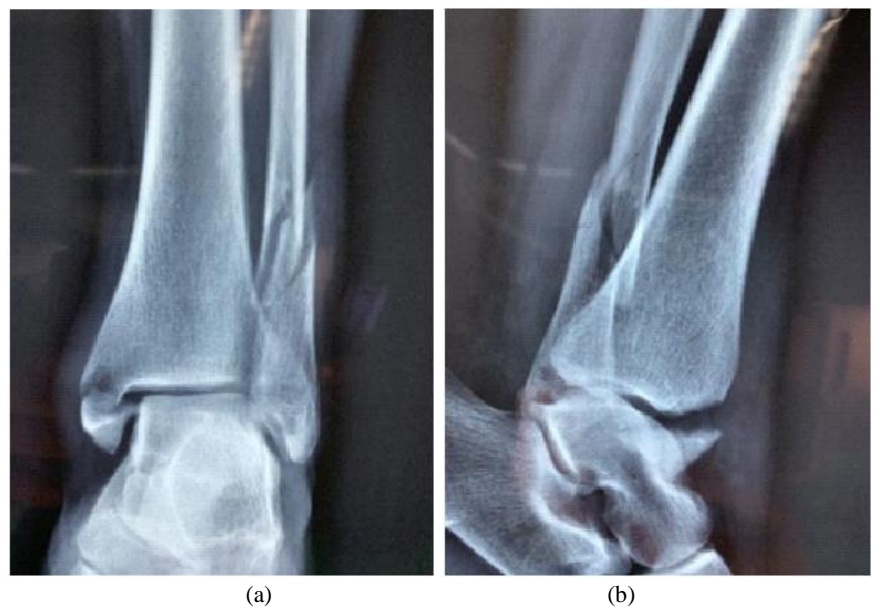
Figure 1: Preoperative x-rays (anteroposterior (a) profil (b) views) appear a bimalleolar fracture Weber C

(one year follow-up) patient returned to previous activity without any restriction, and without pain or any neurological deficit from superficial peroneal nerve.