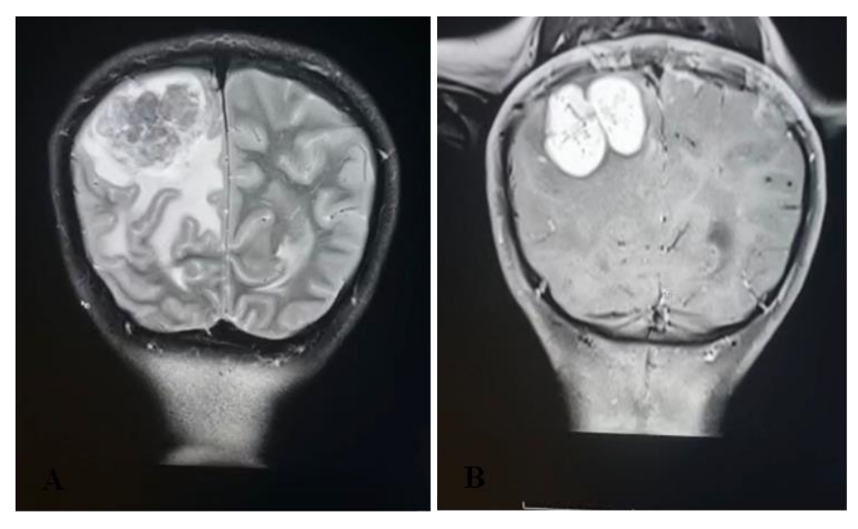
Figure 1. (A) MRI brain T2 weighted image shows right parietal intra-axial lesion with vasogenic edema. (B) MRI T1+C shows that the lesion is avidly enhancing with two nodules.