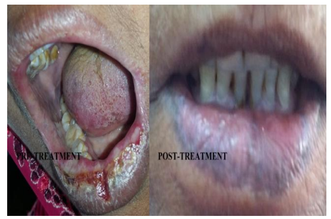
Figure 5 Actinic cheilitis in a vegetable vendor