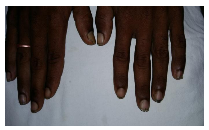
Figure 2 Acrokeratosis verruciformis like lesions over dorsal aspect and nails showing red streaks and diagnostic V shape nicking