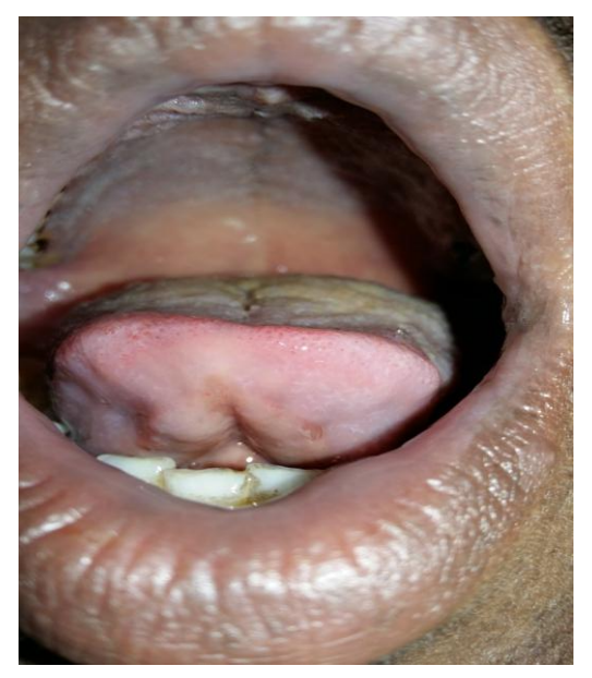
Figure 4 Dirty white cobblestone like papules on the palate