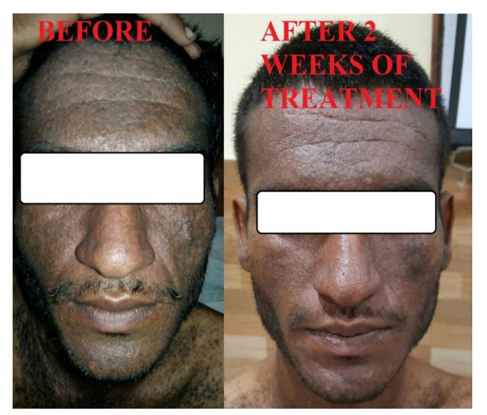
Figure 1 Multiple greasy dark coloured papules and plaques on seborrheic areas

systemic co-morbidities like neuropsychiatric illness and renal disease. <sup>5,6,7,8</sup> So the diagnosis and awareness at an early stage can improve the quality of life of the patients and prevent further complications