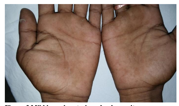
Figure 3 Mild hyperkeratosis and palmar pits