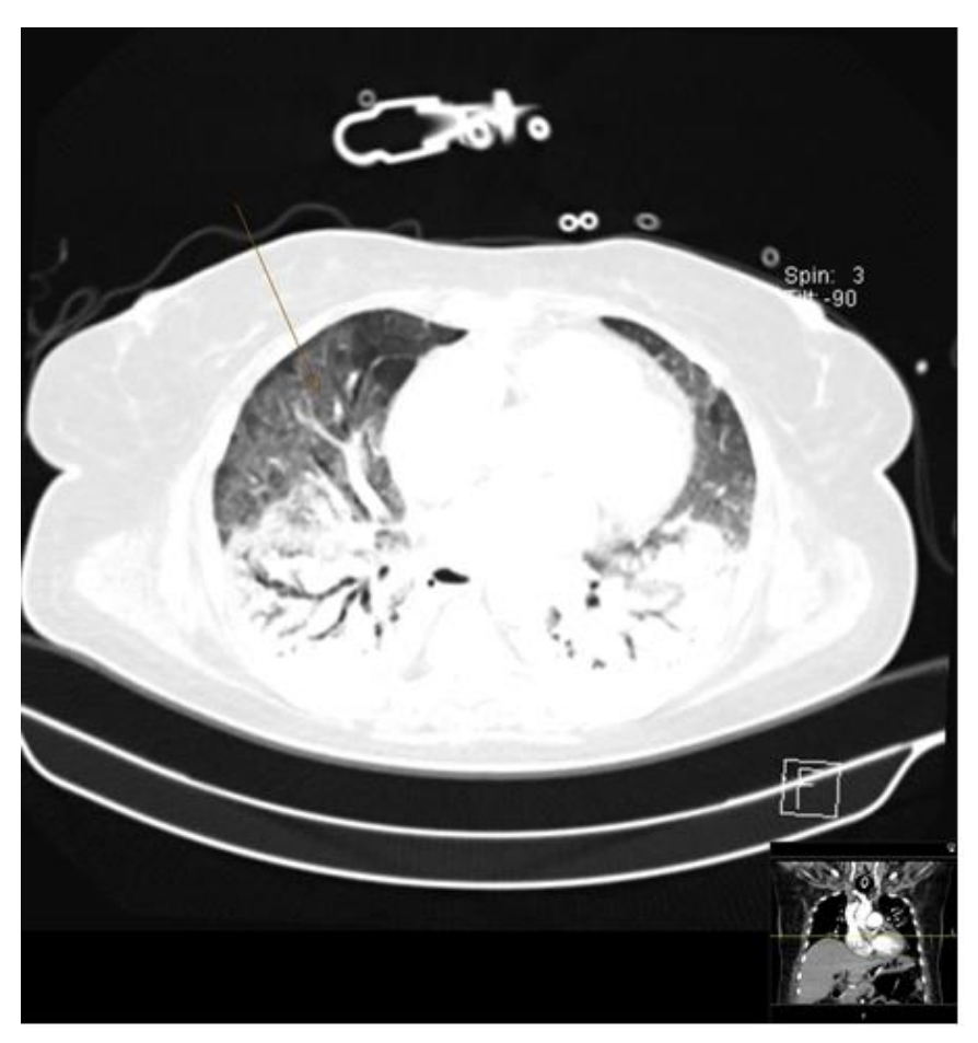
B: 17th day of illness, bilateral, crazy paving infiltrates, in the anterior parts of upper lobes.