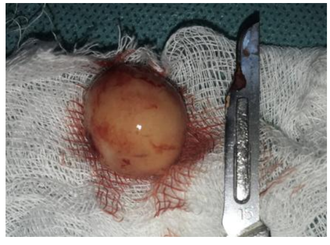
Fig. 4: The excised lesion specimen

Different sizes of multiple foci of same calcified areas within connective tissue has been revealed. Thus, the histological examination concluded a focal fibrous hyperplasia as final