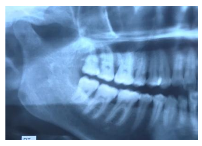
Fig. 2: Bone resorption in front of the papillar region between 14-15-16.

Based on the clinical and radiological data, the provisional diagnosis made was focal fibrous hyperplasia. Differential diagnosis was given, and has included the following chronic fibrous epulis,osteosarcoma and pyogenic granuloma. An exicional biopsy was performed. Under local anaesthesia, excisional biopsy was performed, followed by a surgical flap raised to complete the exicional mass biopsy (Figure 3) and then, analysed under microscope.