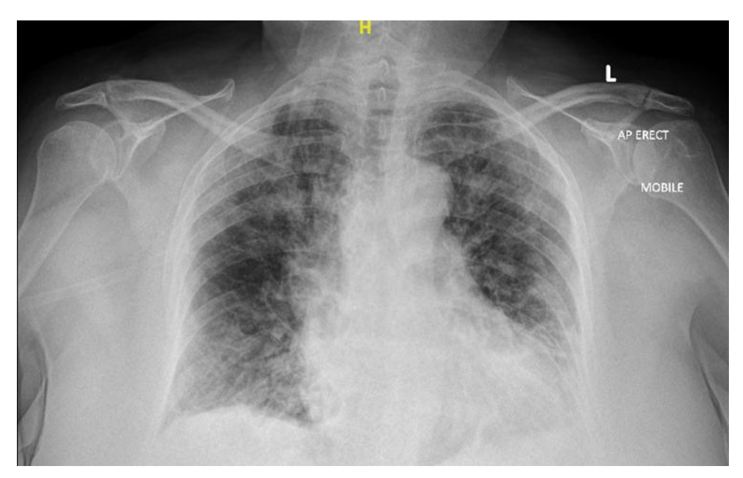
Figure 04: Bi-lateral opacities