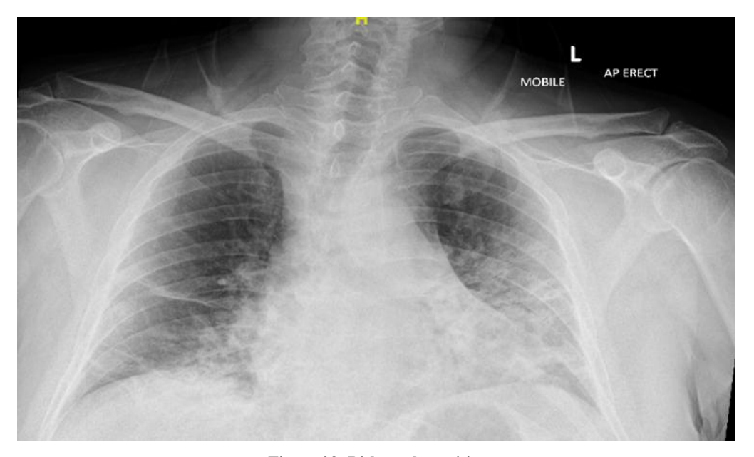
Figure 03: Bi-lateral opacities