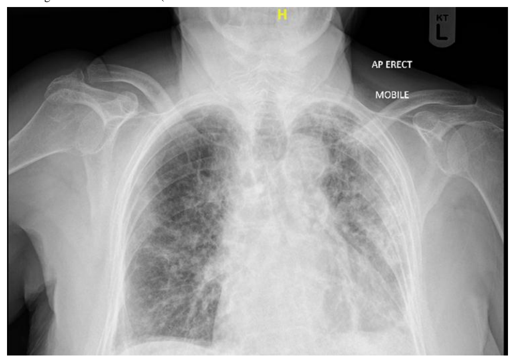
Figure 01: Bi-lateral opacities more on the left lung

protein, D-dimmers, and fibrinogen). Amongst other haemolytic parameters all of them were noted to develop high levels of unconjugated bilirubin, high reticulocyte count, and high LDH which all regained normal levels within 3days of onset of dexamethasone along with haemoglobin level. All of them had a negative antinuclear antibody (ANA) along with negative influenza, respiratory syncytial virus (RSV), and viral respiratory polymerase chain reaction (PCR) panel. Blood cultures and mycoplasma serology were negative. Urine antigens for streptococcal and legionella were unremarkable. Hepatitis viral screen too was negative. There was no clinical indication to perform an HIV test. All of them had bi-lateral opacities on their chest X-ray (Figure 1,2,3,4,5).