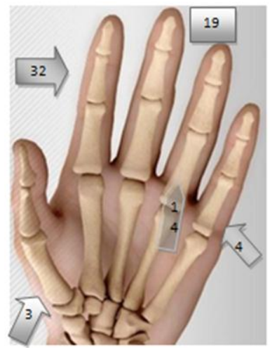
Figure 1: Anatomical distribution of GCTTS in 79 cases: Thumb (3), Index (32), Middle (19), Ring (14), Little finger (11) (grey arrow).

Seventy nine patients were included in this study. Fifty five were females and twenty four males with an average age of 38,8 years-old (range23-65yrs). The mean duration of symptoms before excision ranged from eight months to ten years. The most frequent location of tumor was in index finger(32/79 patients, 40,5%), while the other distribution of the tumor was in thumb(3/79 patients, 3,8%), middle (19/79 patients, 24%) ring(14/79 patients, 17,8%), and little finger(11/79 patients, 13,9%) ( Fig.1 ). The majority of patients was presented in outpatient's department for a painless swelling on volar side of the digits, while only 13(16,45%) patients presented for painful mass and numbness of the digit in 7(8,9%) cases. The dominant hand was affected in 48 cases (60,75%). Among causes, 17(21,5%) cases referred a past trauma, 5(6,3%) cases had rheumatic arthritis and the rest 57(72,2%) cases had unknown etiology.