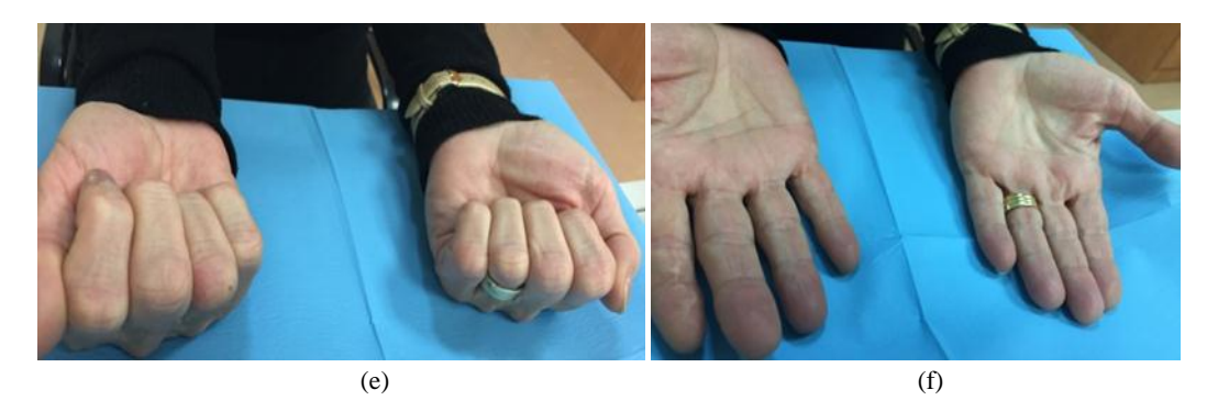
Figure 3: Female 58 years old with a painful swelling (blue arrow) on volar distal phalanx of right index finger for ten years(a). Tumor localizated (b) on flexor profundus tendon (black arrow) of index finger over attaching to the distal phalanx with lateral extension(blue arrow). GCTTS type Ia (Al- Qattan)(c). Full excision of the tumor (d). At final follow-up (52 months) full range of motion without recurrence (e,f)