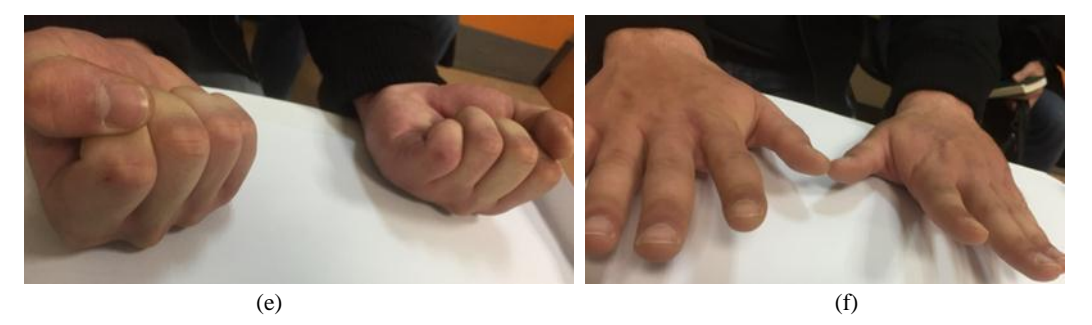
Figure 2: Man 34 years old(a) with a swelling on volar middle phalanx of right ring finger for 3 years (black arrow). MR I(b) appears GCTTS (white arrow). Tumor over flexors tendons (black arrow) with lateral extension (blue arrow) which classified as type IIb (Al-Qattan)(c). Full excision of the tumor (d). At final follow-up (50 months) full range of motion without recurrence (e,f)

Postoperatively sutures were removed at 10-12 days and a standard protocol of rehabilitation was performed in all patients. Physiotherapy treatments were delivered twice a week. The main goal in the first sessions was the decrease of post-operative edema and the prevention of scar tissue formation. Patient was trained to perform scar massage on his own, passive and self assistive finger flexion and extension for 2 weeks and then when pain and edema decreased active range of motion was performed in pain limit. Patients received 20 sessions of physiotherapy treatment in order to eliminate scar formation and enhance the range of movement and