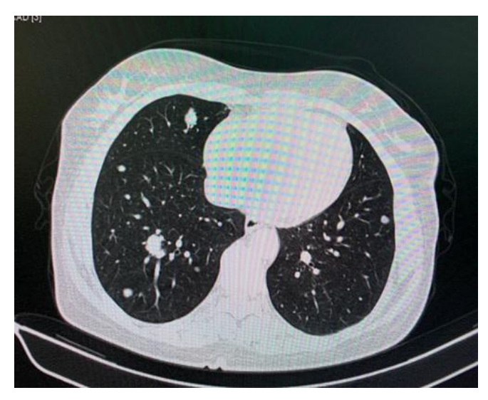
Figure 1: CT of chest revealed multiple pulmonary metastasis upon diagnosis.